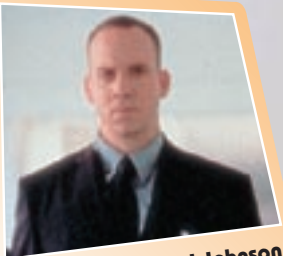
Johnson J Johnson

Johnson is a very serious agent who is sent to find Patrick to alert him to his ' cause '.