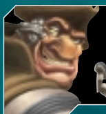
John Silver - the ship's cook