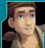
Jim Hawkins - the hero

Here are the characters from the film Treasure Planet. There are describing words (adjectives) listed next to each picture. Read each list and then create a 'Who's Who of Treasure Planet' brochure, writing a paragraph for each character. Use a dictionary to look up any words that you do not know.