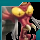
Scroop - shiphand and pirate