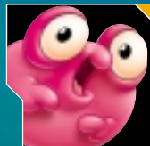
Morph - Silver's pet