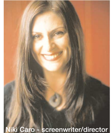
Niki Caro - screenwriter/director

Casting the role of Pai was an enormous task. 'I didn't want a child actor, I wanted a real child,' recalls Caro. 'I knew I wasn't looking not for 'a' girl that could do it, I was looking for 'the' girl. She didn't have to look a certain way, she didn't have to be a certain age...but we were looking for a special child.'