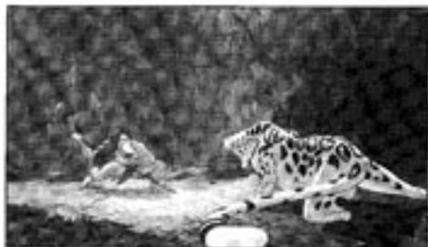
Tazari © Owned by Edgar Rice Burroughs, Inc. and Used by Permission, © Burroughs and Disney